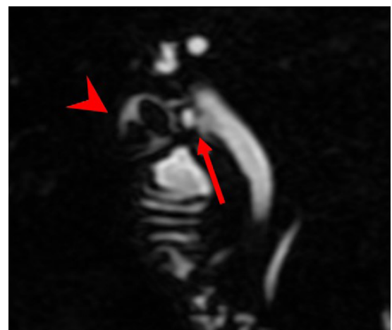
Fig.2: Magnetic resonance cholangio-pancreatography showing a cystic image with two dark-filling defects, compatible with RGB (arrow-head), attached to the main biliary duct by the cystic duct (arrow).